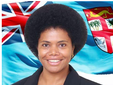
Hon. Lenora Qereqeretabua Deputy Chairperson Deputy Speaker of Parliament Assistant Minister for Foreign Affairs