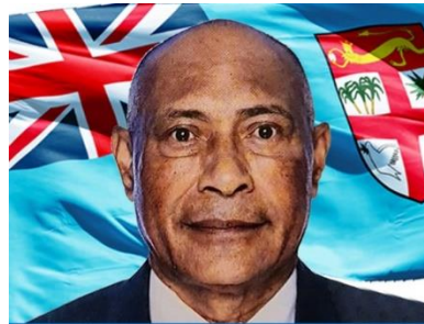
Hon. Viliame Naupoto Chairperson of the Standing Committee on Foreign Affairs and Defence

Under Standing Order 109(2)(e) the Standing Committee on Foreign Affairs and Defence is mandated to look into matters related to Fiji's relations with other countries, development aid, foreign direct investment, oversight of the military, and relations with multi-lateral organizations. The members of the Standing Committee on Foreign Affairs and Defence are as follows: