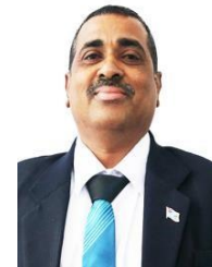
Hon. Joseph Nand Opposition Alternate MP