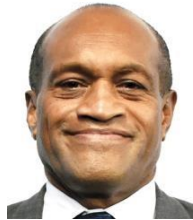
Hon. Jone Usamate Deputy Chairperson Opposition MP