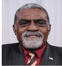
Hon. Tomasi Tunabuna Chairperson Assistant Minister for Agriculture Government MP