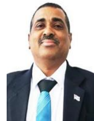
Hon. Joseph Nand Opposition Alternate MP

A blue ink signature of Hon. Joseph Nand, written in a cursive style, enclosed in a rectangular box.