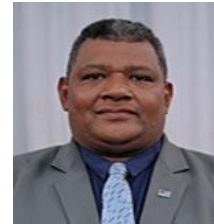
Hon. Isikeli Tuiwailevu Assistant Minister for i Taukei Government MP