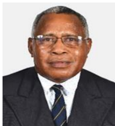
Hon. Iliesa Vanawalu Assistant Minister for Education Government MP