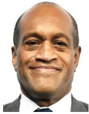
Hon. Jone Usamate Deputy Chairperson Opposition MP

A blue ink signature of Hon. Jone Usamate, written in a cursive style, enclosed in a rectangular box.