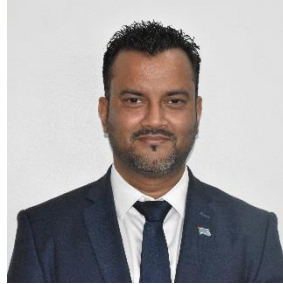
Hon. Alvick Avhikrit Maharaj (Chairperson)

The Committee is made up of both the Government and Opposition Members, pursuant to Standing Order 115. Members of the Standing Committee on Justice, Law and Human Rights, 2018-2022 Parliamentary Term, are as follows: